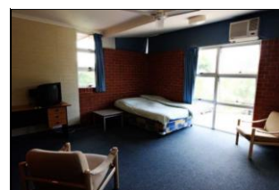
3. Ensuted Room

Comments / special requirements (dietary) – Halal and vegetarian diets are covered in the rate Daily surcharge of $10 for vegan, nut allergies (Others at the discretion of the catering manager).