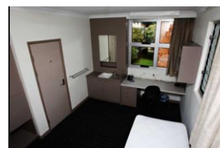
2. Shared Ensuite